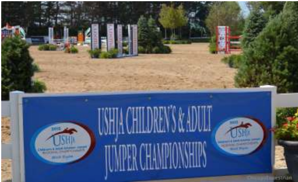
The large Grand Prix ring at Ledges Sporting Horses is set for the championships.

After the week at Ledges Sporting Horses, Showplace Productions will shift to Lamplight Equestrian Center for the popular Showplace Fall Classic, showcasing the IHJA Medal Finals and a $30,000 Showplace Grand Prix along with the Marshall & Sterling Midwest Finals and the USEF Zone 5 Horse of the Year Finals.